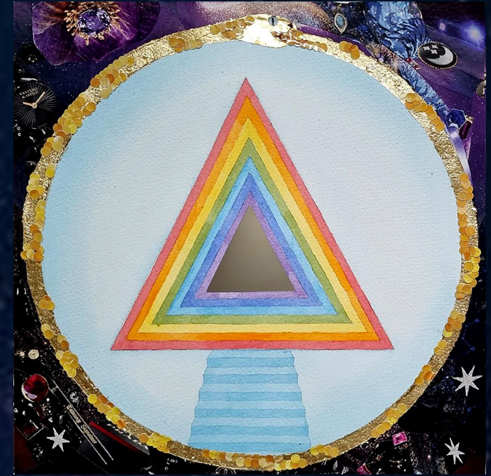
# artwork 3